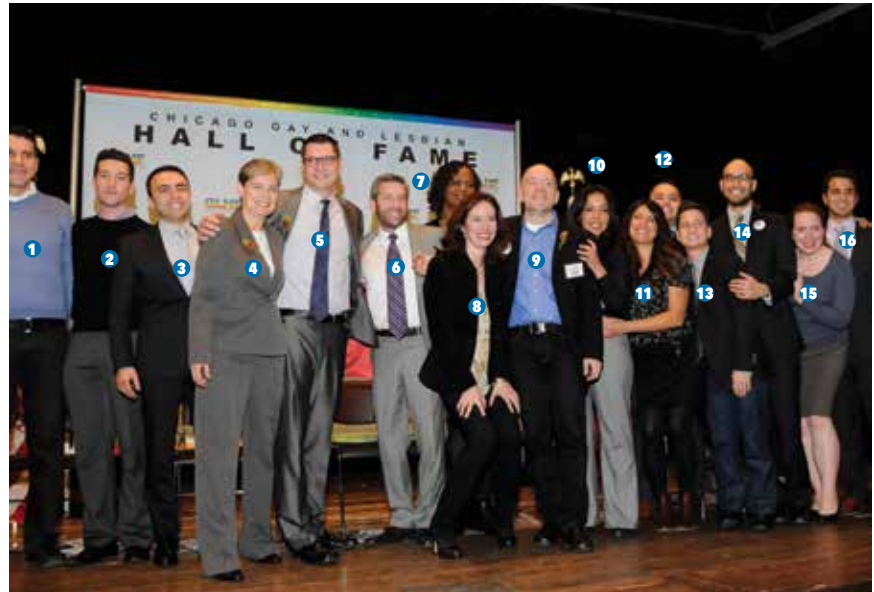
Lambda Legal at the Chicago Gay & Lesbian Hall of Fame on November 12: