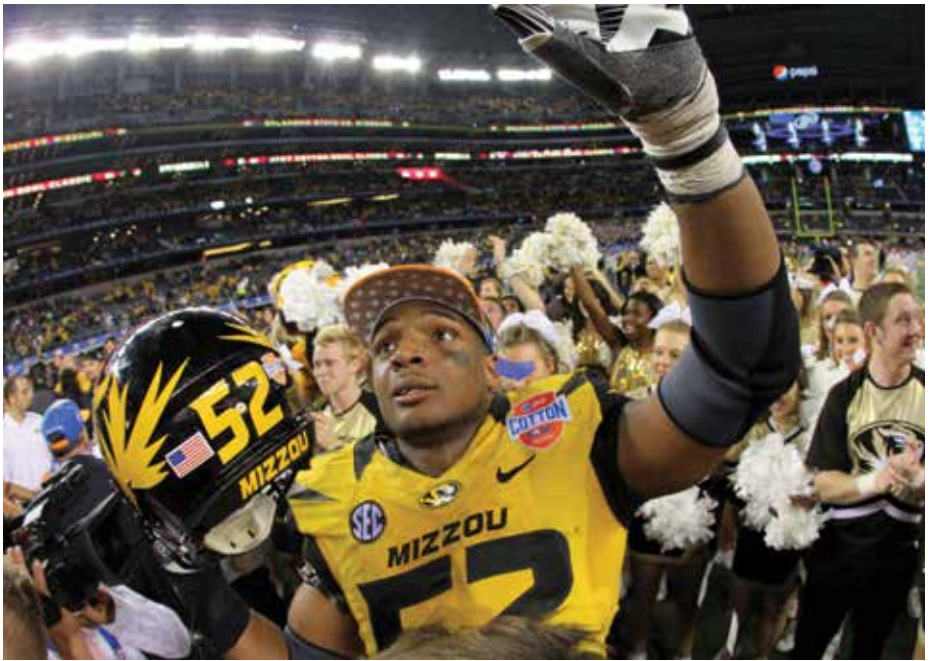
Football star Michael Sam became the first openly gay player to be drafted into the NFL.

The letter quotes from the NFL's own nondiscrimination commitment, as outlined in its collective bargaining agreement, which says, "There will be no discrimination in any form against any player...any Club...because of race, religion, national origin, [or] sexual orientation," and that "the prohibition against discrimination in any form does not allow for rejection of a draft prospect based on sexual orientation."