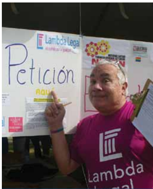
San Juan Pride: A petition signer dons our T-shirt at Lambda Legal's first booth at a Pride event in Puerto Rico, June 6, 2010.