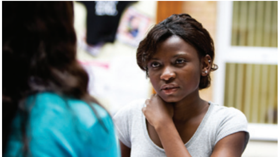
Are young people getting the right support and information?