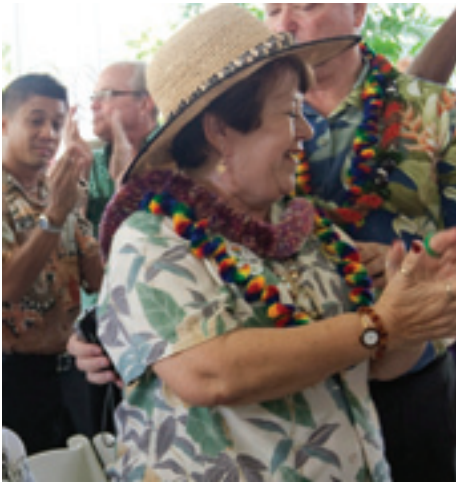
Hawai'i residents say aloha to greater rights.