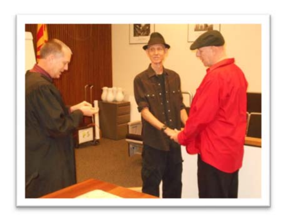
Marriage ceremony at the Pima County Courthouse, November 7, 2014.

our commitment ceremony in 2007. Inside the rings