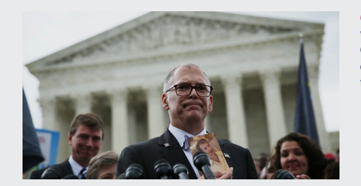
Obergefell v. Hodges, where the Supreme Court made marriage equality the law of the land.