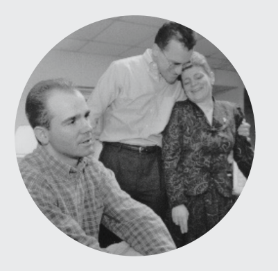
Nabozny v. Podlesny, where courts held - for the first time - that federal law compelled K-12 schools to protect LGBT students from bullying and harassment.