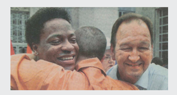
Lawrence v. Texas, historic case that overturned all remaining sodomy laws in United States.